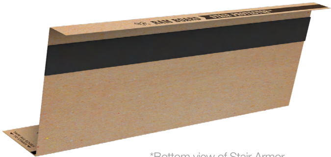
*Bottom view of Stair Armor

The grip strip backing on Stair Armor anchors the product in place, reducing movement and increasing absorption of impact for your stair protection.